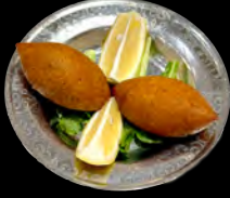
* ICLI KOFTE