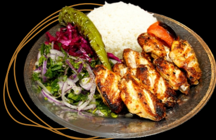
CHICKEN WINGS ..... $21.99 8 Pieces Served with Rice, Salad, B.B.Q Pepper and Tomatoes