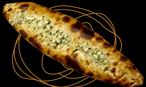
SPINACH & CHEESE PIDE ..... $18.99 Spinach, Mozzarella and Feta Cheese