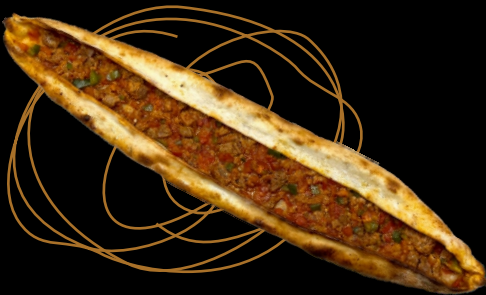
DICED MEAT PIDE ..... $22.99