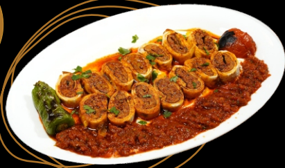
BEYTI KEBAB ..... $26.99 Veal Kebab Wrapped in Lavash, Yogurt, Garlic, Mashed Spicy Salad, B.B.Q Tomato and Pepper and Melted Butter