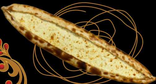
CHEESE PIDE ..... $17.99 Mozzarella Cheese