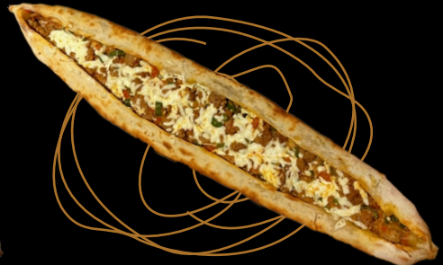
DICED MEAT MOZZARELLA PIDE ..... $22.99