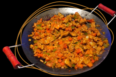
SAC TAVA ..... $29.99 Cubed Meat, Beef Stir Fry in Special Tawa Pans, with Onions, Tomatoes, Green Peppers, and Some Spices Served with Fresh Bread