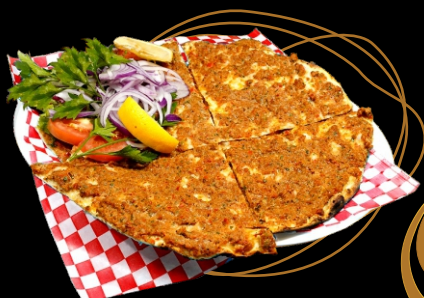
LAHMACUN ..... $16.99 Mindly Spiced Ground Beef Blended with Onions, Garlic, Peppers, Tomatoes, Parsley, and Herbs on a Thin Crust Dough