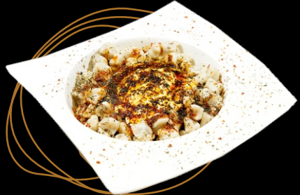
MANTI ..... $26.99 Tiny Lamb-Stuffed Dumplings Topped with Brown Butter Sauce, Garlic, Mint and Yogurt Sauce